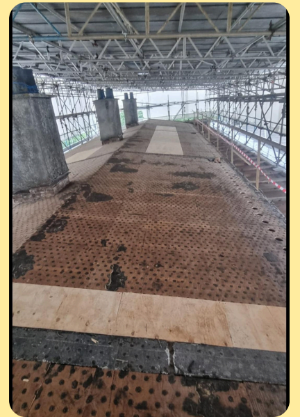
Roof replacement in progress

It has been great continuing to meet so many of you during my introductions. I am currently meeting residents in Block 10, but if you see me around site and we haven't yet had a chance to speak, please feel free to stop me for a chat. I'm always happy to make time for residents.